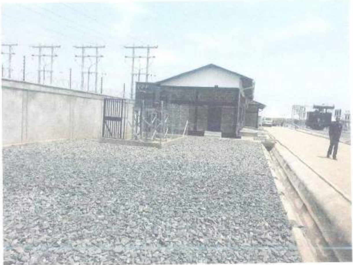
COMPLETED 66KV THIKA SUBSTATION