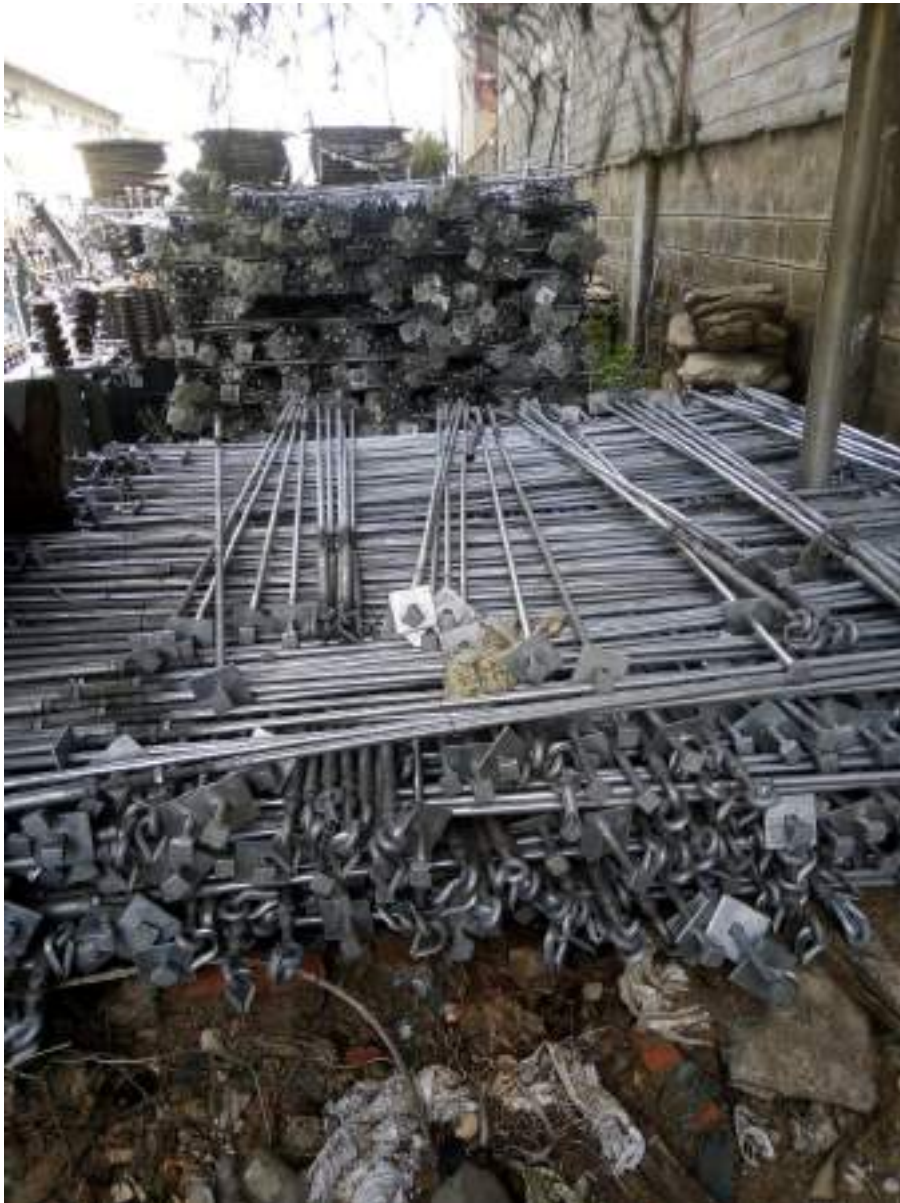
STAYRODS AND OTHER GALVANISED MATERIALS DELIVERED TO RURAL ELECTRIFICATION AUTHORITY STORES (KENYA)