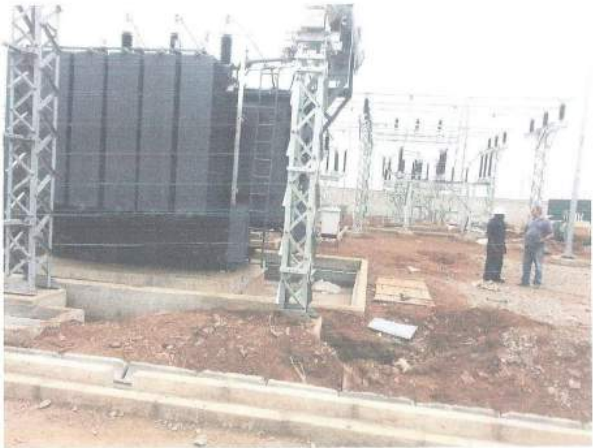
CONSTRUCTION OF THE SWITCHYARD WITH 45MVA TRANSFORMERS AT THIKA SUBSTATION