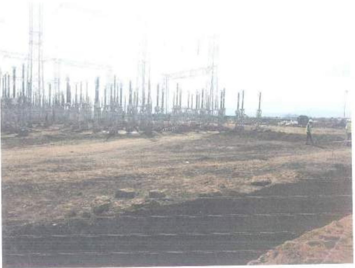
CIVIL AND ERECTION WORKS AT THE 220KV ATHI RIVER SUB STATION