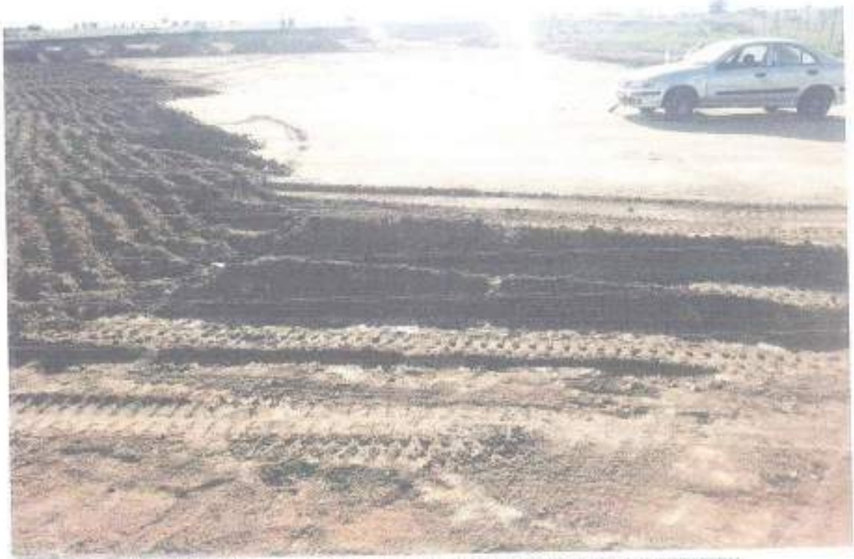
SUB-STATION PLATFORM CONSTRUCTION AT THE PROPOSED 220/66KV ISINYA SUBSTATION