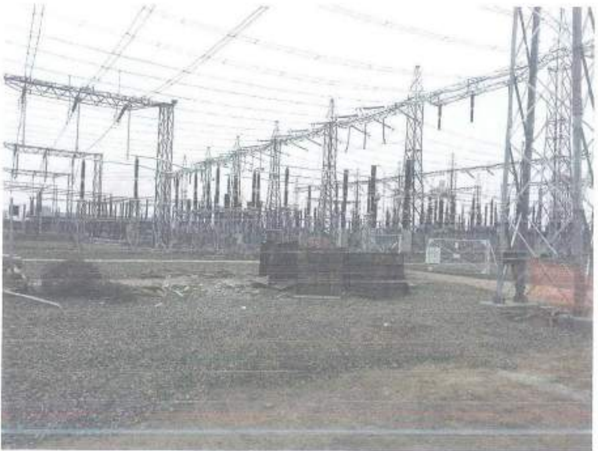
CIVIL AND ERECTION WORKS AT THE 220KV DANDORA SUBSTATION