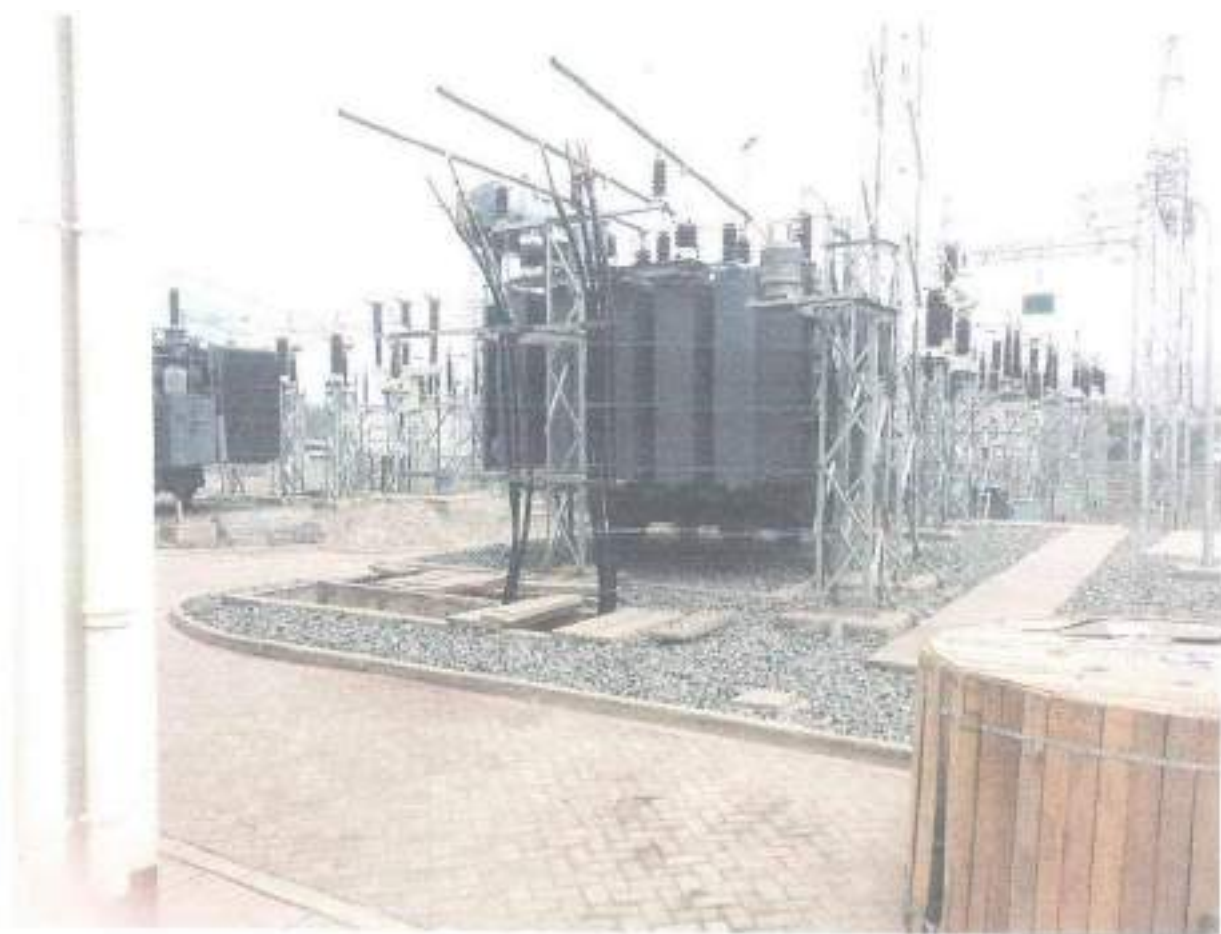
SWITCHYARD CONSTRUCTED BY OUR FIRM