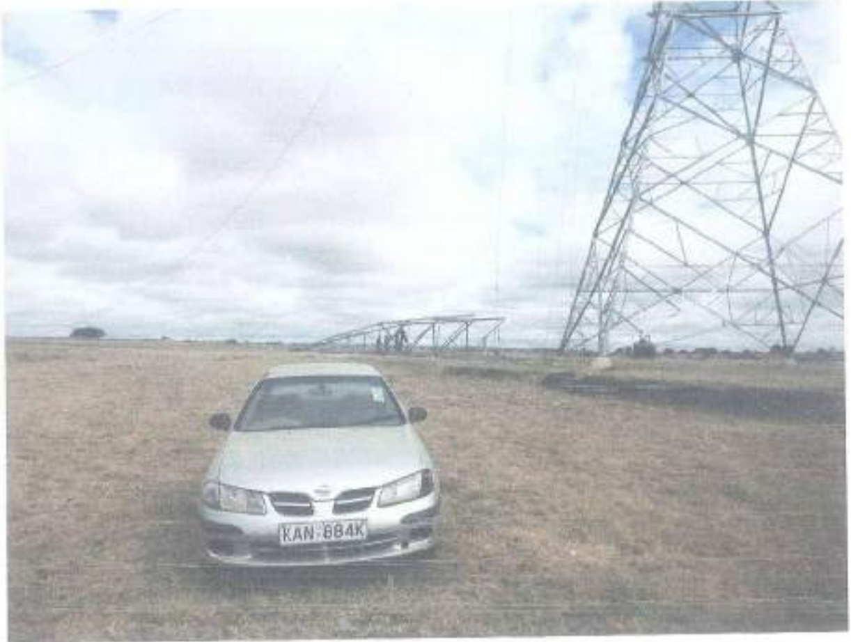
ERECTION OF 400KV PYLONS AT ISINYA