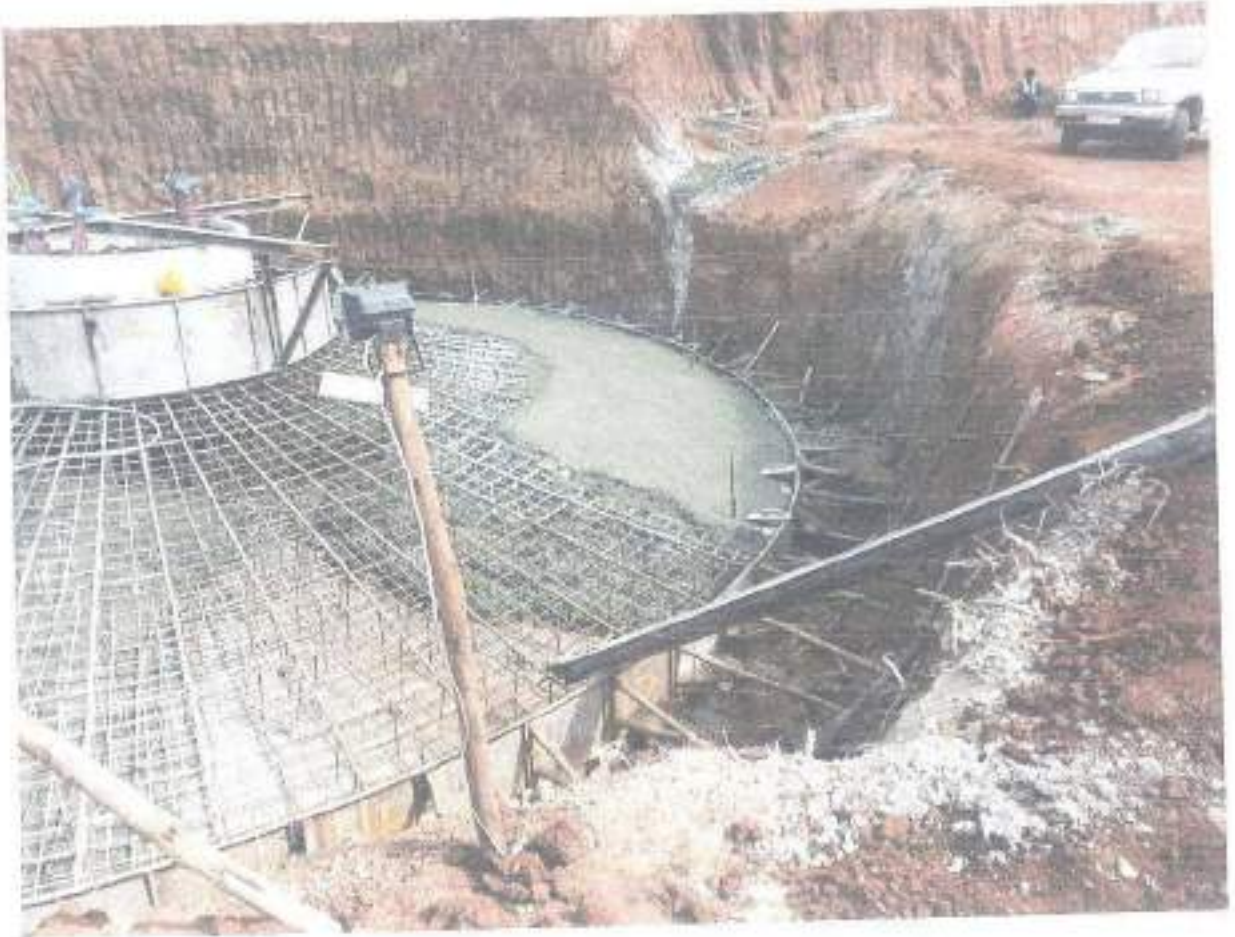
CONSTRUCTION OF WINDMILL FOUNDATION AT THE NGONG WINDMILL PROJECT