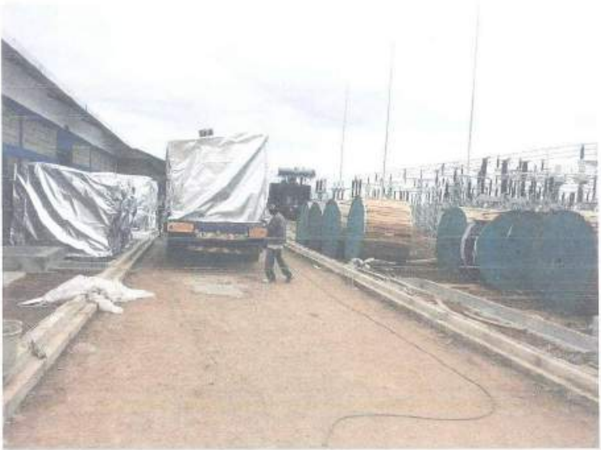
CONSTRUCTION WORKS AT THIKA SUBSTATION