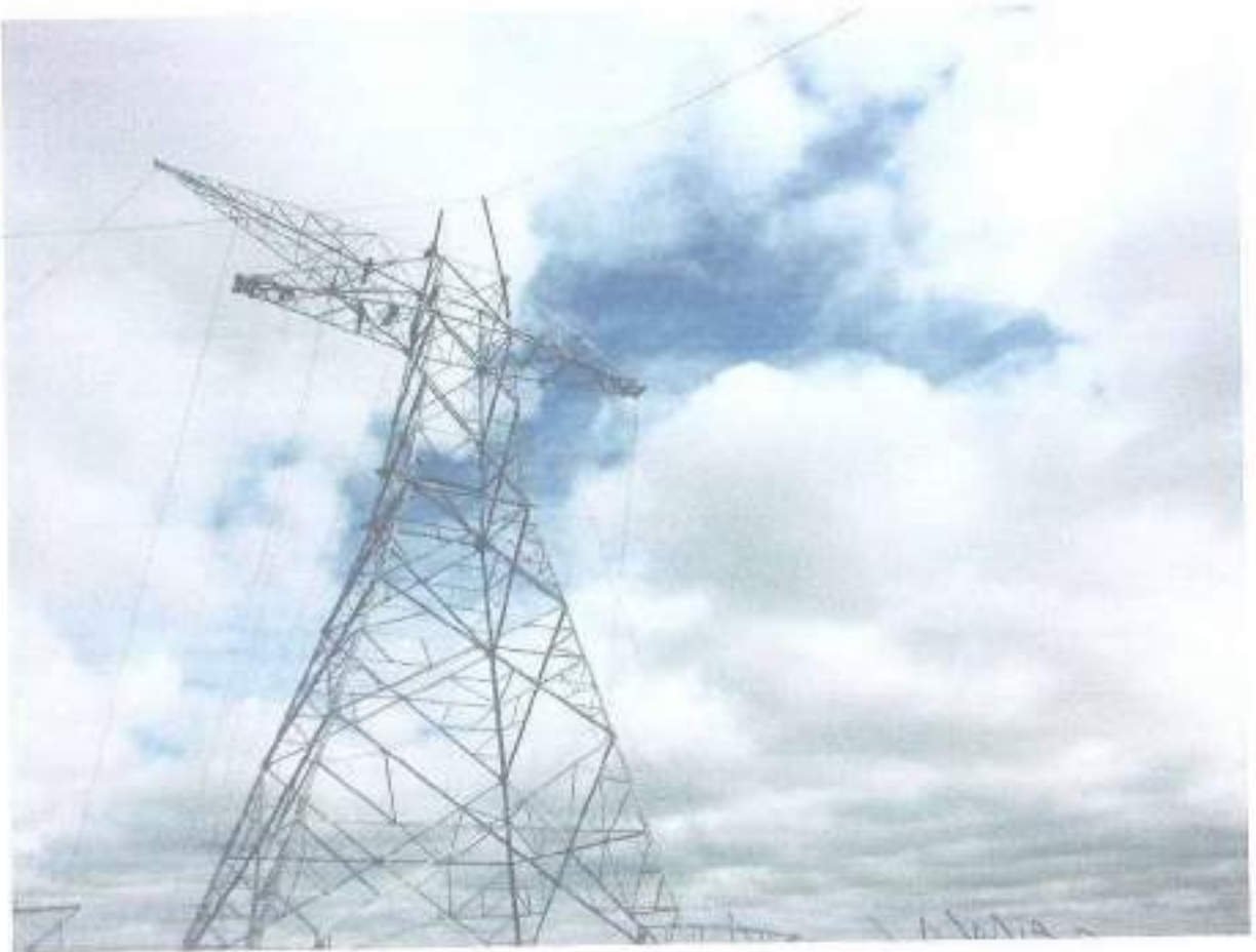
ERECTION OF 400KV TRANSMISSION LINE PYLONS AT KAJIADO