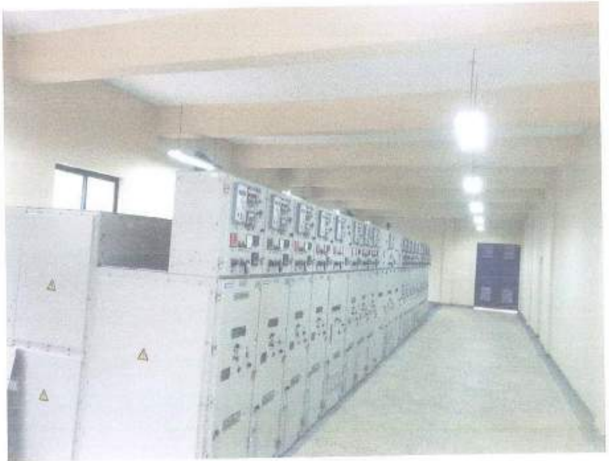
COMPLETED CONTROL ROOM CONSTRUCTED BY OUR FIRM