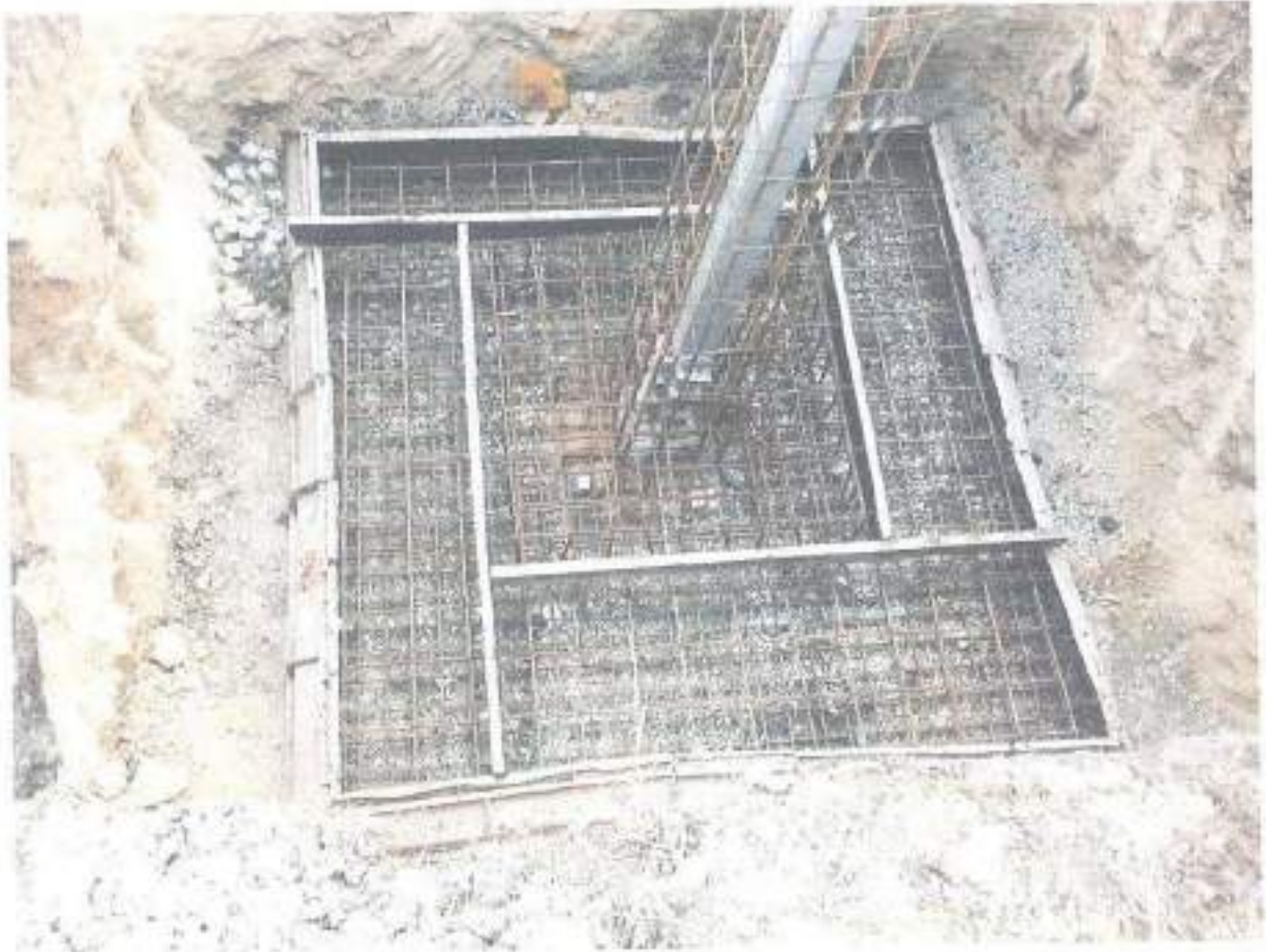
132KV PYLON PAD AND CHIMNEY FOUNDATION