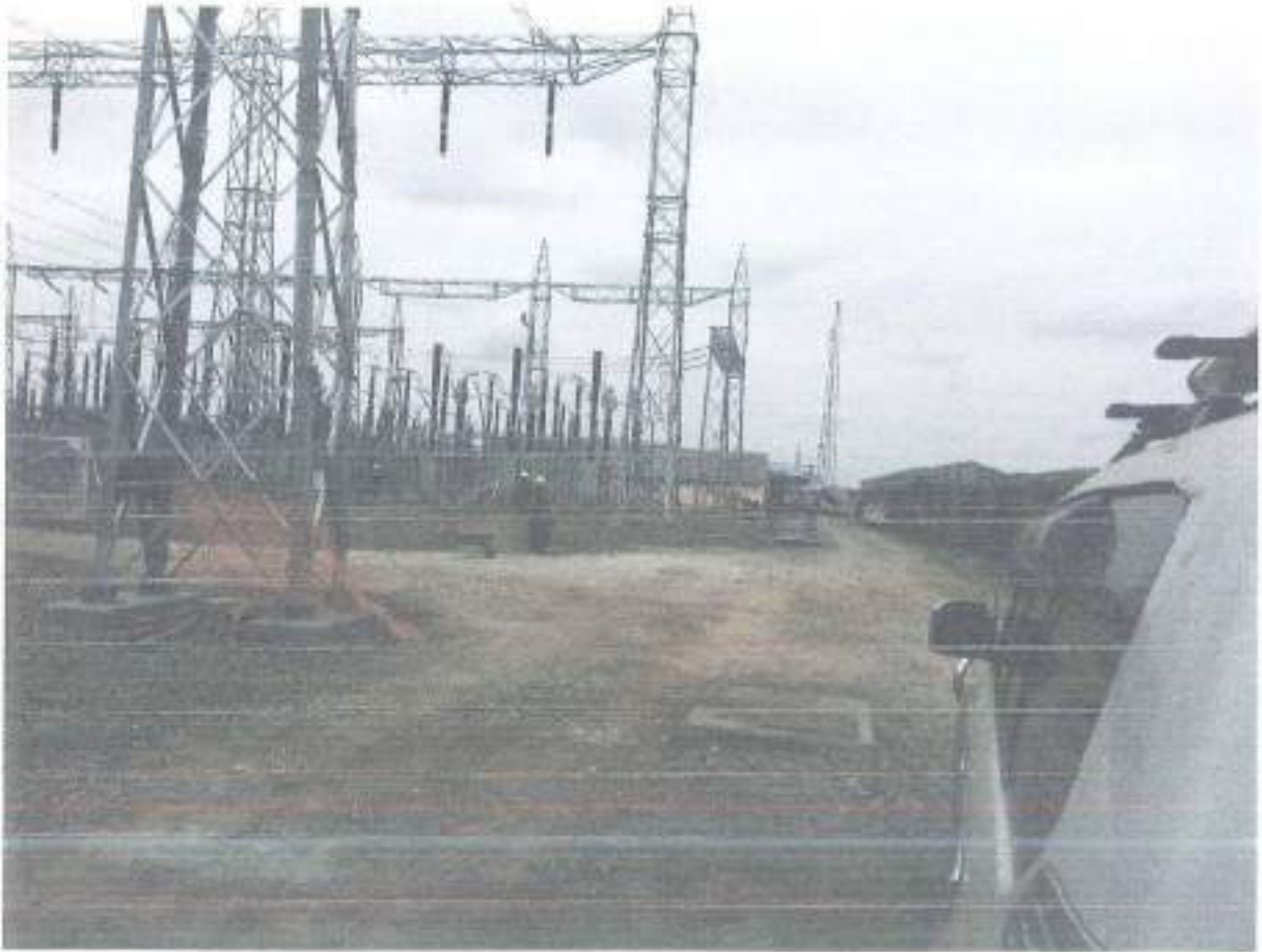
CONSTRUCTION OF AN ADDITIONAL BAY AT THE 220KV LESSOS SUBSTATION