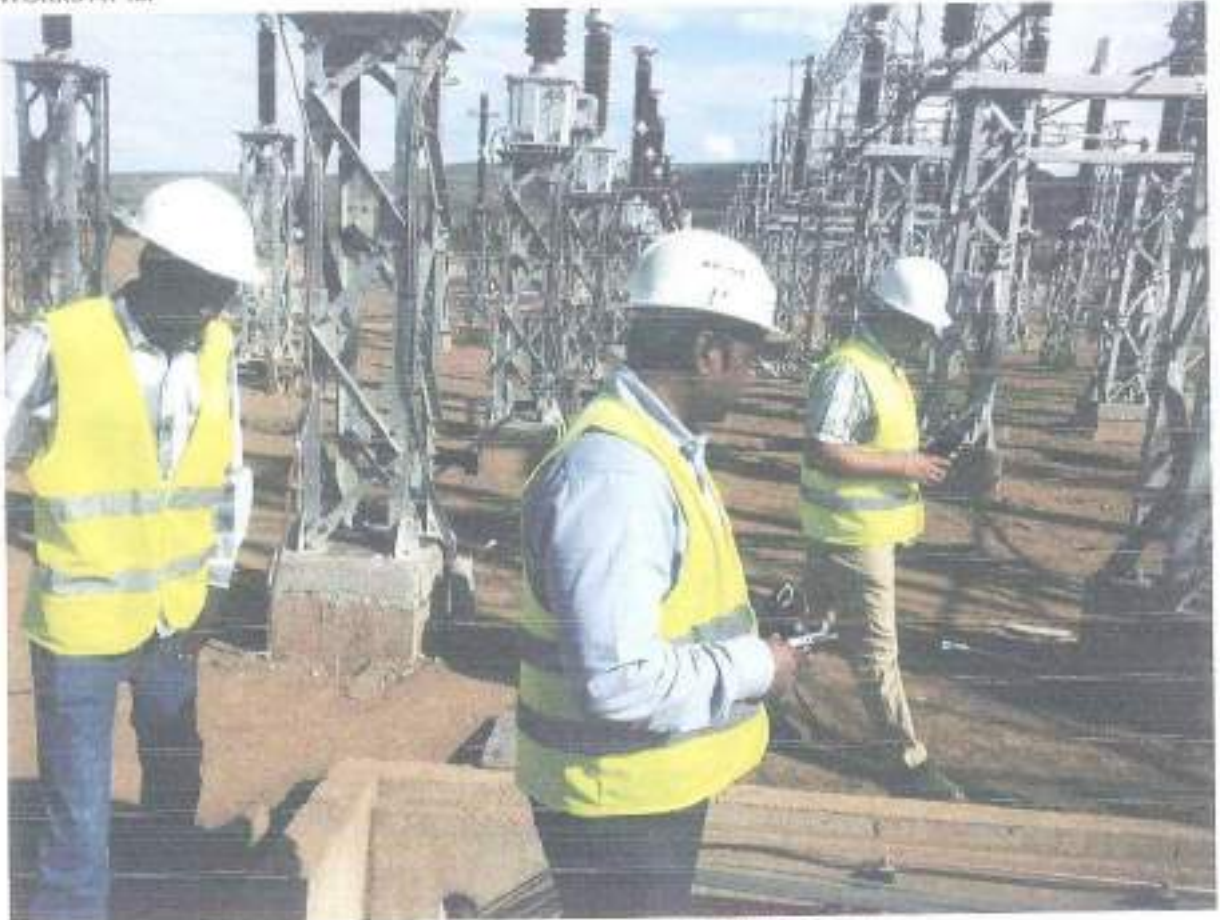
CIVIL AND ERECTION WORKS AT THE PROPOSED 220KV ISINYA SUB-STATION