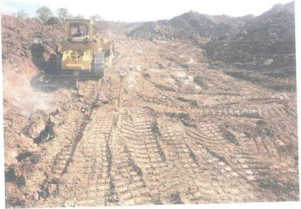
PLATFORM ESTABLISHMENT AT THE PROPOSE 220/66KV ATHI RIVER SUB-STATION